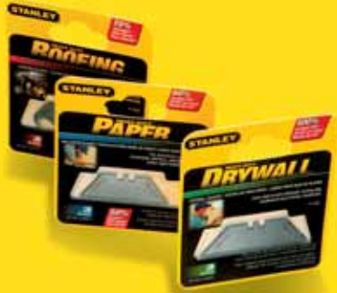
Packages are clearly marked for quick identification

Everyone knows the importance of the “right tool for the job”. Application Specific Blades are designed with unique features for cutting drywall, roofing shingles and paper. Each blade is constructed of carbon alloy steel. Due to our patented S3 Technology, our paper blades start sharper and stay sharper, our roofing blades are stronger, and our drywall and paper blades deliver more cuts per blade. The entire line