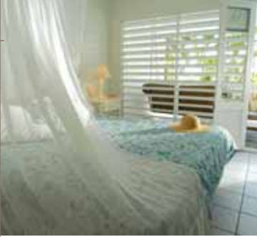
Sebel Reef House, Brigadier Room