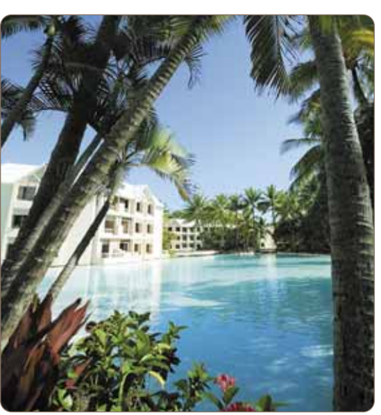
Sheraton Mirage Port Douglas

n the tropical environment of North Queensland, the essence of luxury has been captured at Sheraton Mirage Port Douglas, which stunningly combines wilderness and natural beauty. Set on sweeping Four Mile Beach between the Great Barrier Reef and the Daintree Rainforest in Port Douglas, Sheraton Mirage