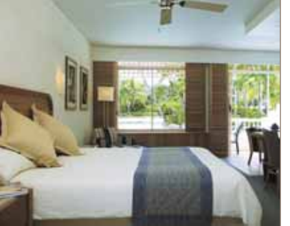
peraton Mirage, Hotel Room