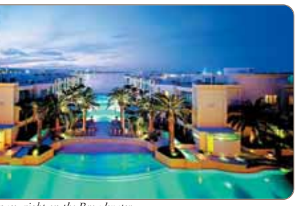
Palazzo Versace, right on the Broadwater

The Palazzo Versace hotel sets the standard in luxury accommodation and dining, with 205 elegant rooms, 72 condominiums, three restaurants, two bars, Salus per Aquum Spa and Versace boutique. Italian architecture and craftsmanship have created a new experience in design and living combining the best of European style and elegance with the friendliness and enthusiasm for which Australia is renowned.