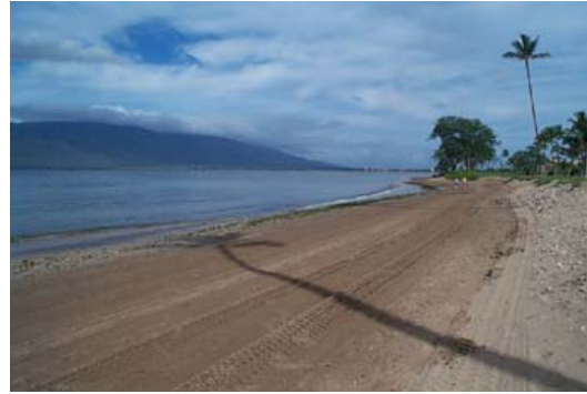
Waipuilani Beach at Maui Sunset