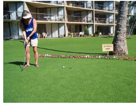
Golf putting green