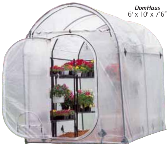
DomHaus 6' x 10' x 7'6"