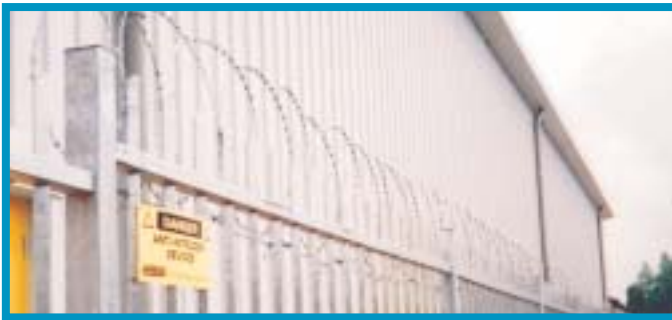
Support posts are not required if overlapped and clipped to fence