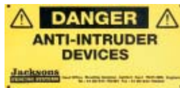
Warning signs available. Details on request