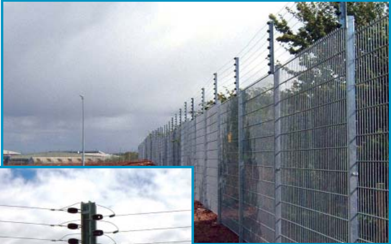
EuroGuard Flatform with Alarm-aFence