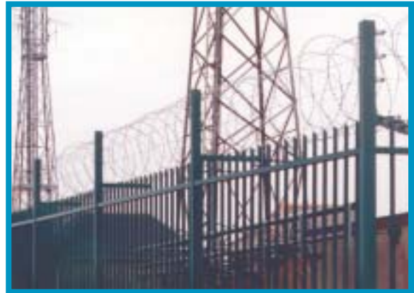
Concertina Barbed Tape set on the inside of fence on special supports

Short and Medium barbed tape approximate coil length 200M.