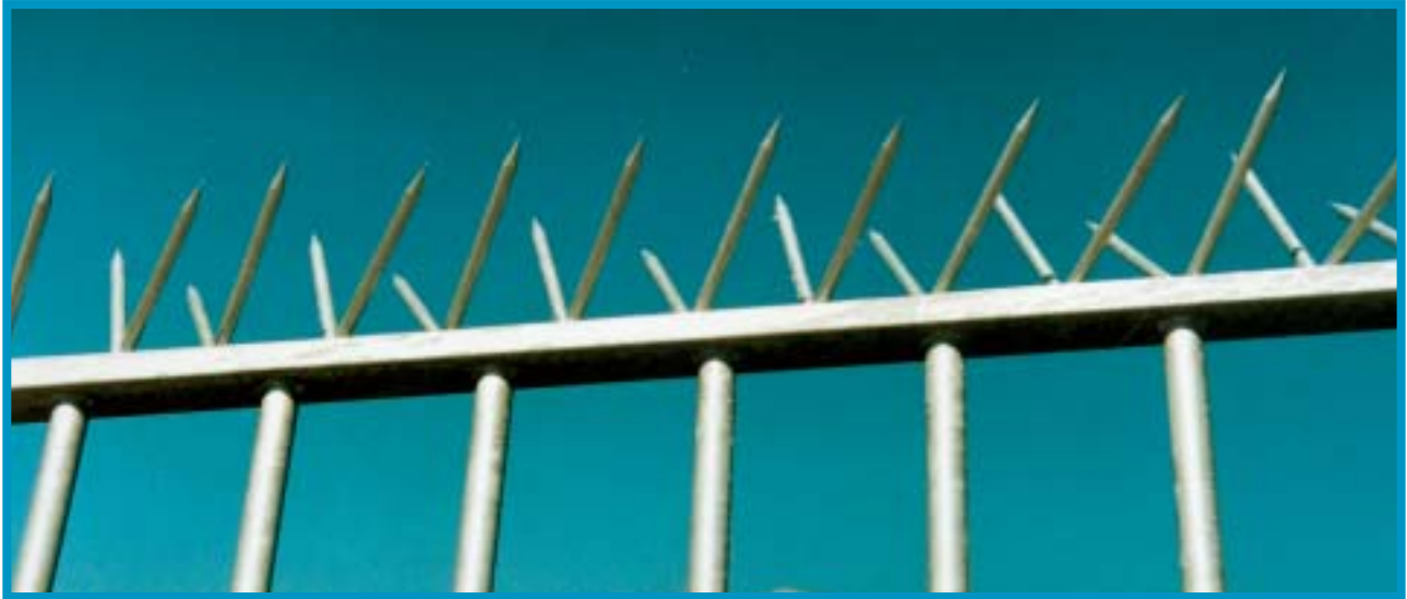
Viper Spike on Sentry Bar fencing