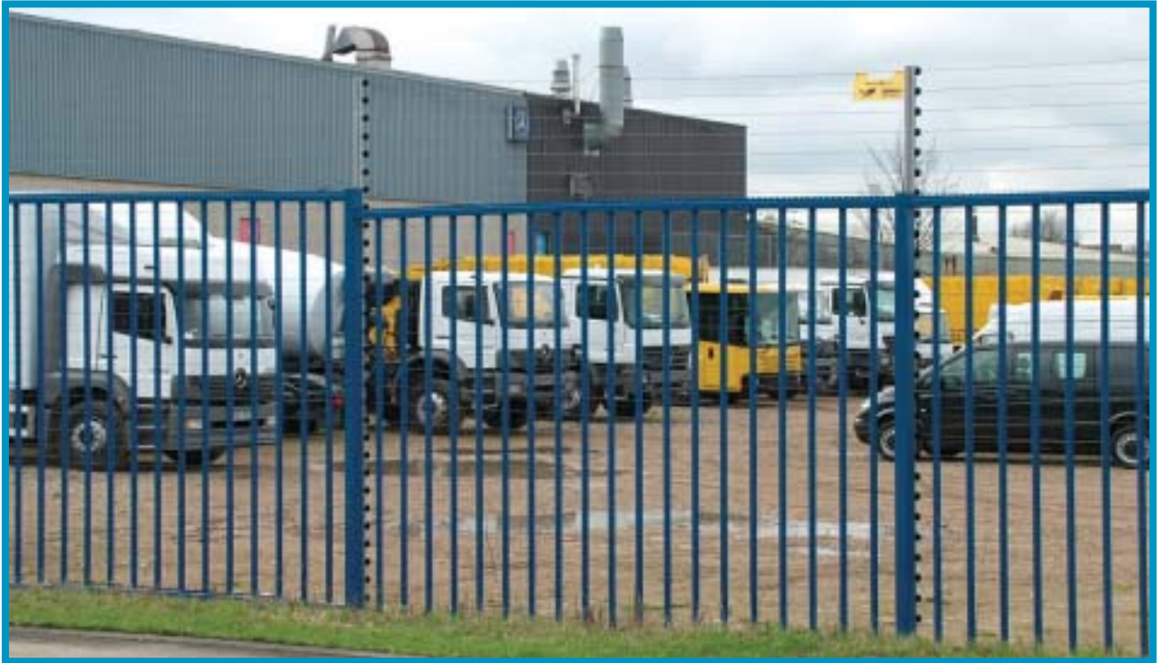
Coated Sentry Bar fencing with Alarm-aFence installed as additional security