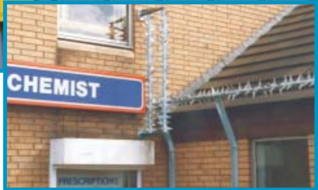
Rota-Sp!ke used to protect a pharmacy

Rota-Sp!ke is made entirely from hot-dip galvanized steel, it is also available with an additional durable coating in green, black, white, blue or grey. (Other colours on request). So it stays looking not only fierce, but good too.