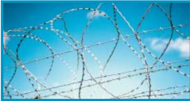
Loops of Concertina Barbed Tape are firmly clipped together making them impossible to part