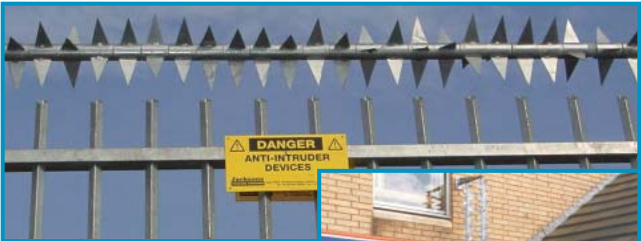
Rota-Sp!ke above Barbican fencing.