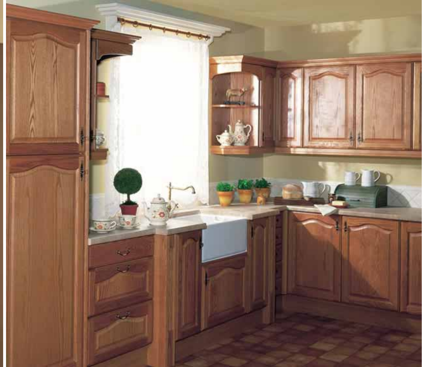
Solid Oak frame, veneered centre panels