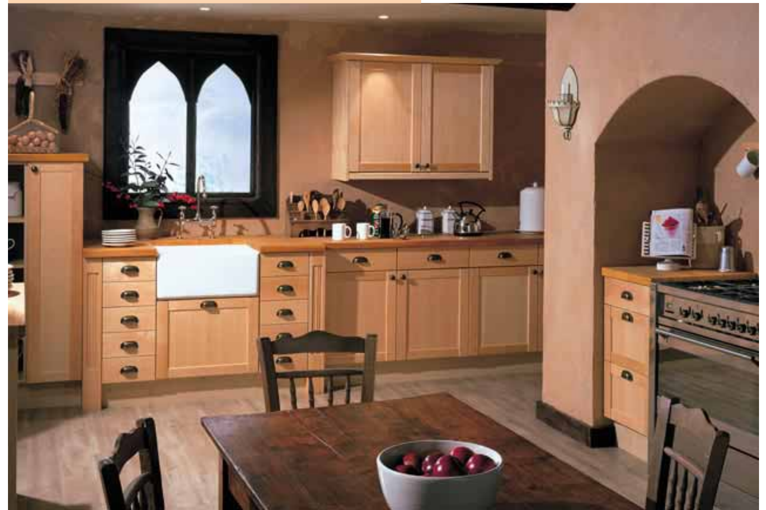
Solid Maple frame, veneered centre panels