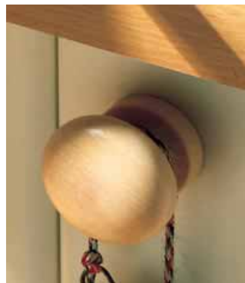
Hartford is supplied as standard with the handle shown above

Inspired by the early design principles of the Shakers, Hartford is a simple door. The oyster finish of Hartford is set off here with beech door knobs from Crown's accessory range.