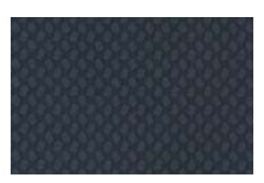
Anthracite Sports Cloth