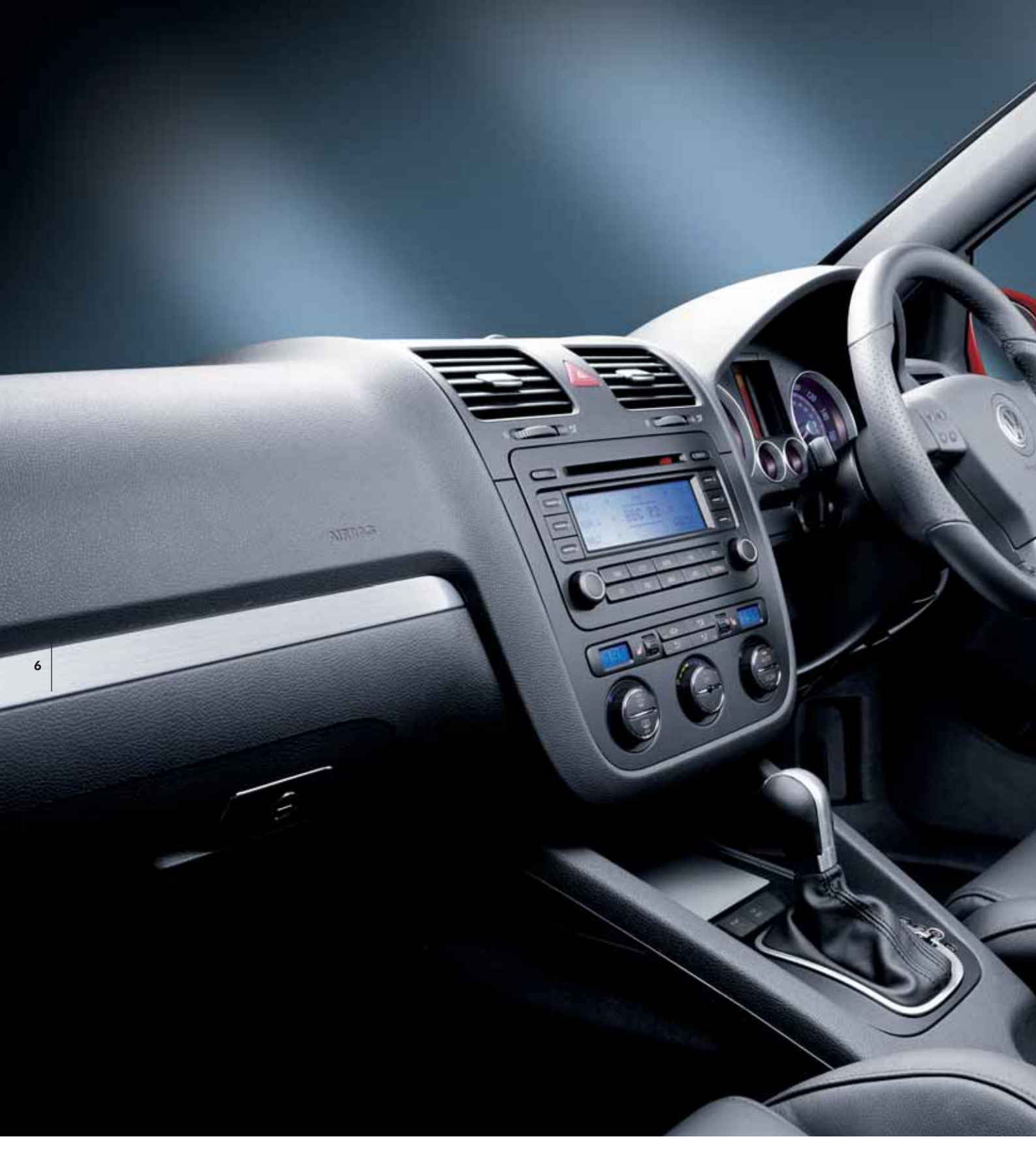
The 147kW Golf GTI with optional DSG and leather upholstery.