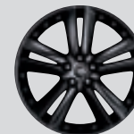
20" Kalimnos Gloss Black Alloy