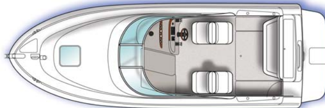
Cockpit w/Optional Seating Layout (Not Available w/Fishing Package)