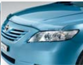
BONNET PROTECTOR & HEADLAMP COVERS (SOLD SEPARATELY) Applicable for all Camry grades.