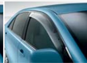
FRONT WEATHERSHIELDS Applicable for all Camry grades.