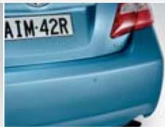
PARKASSIST - REVERSE PARKING SENSORS (4-HEAD KIT) Applicable for all Camry grades.