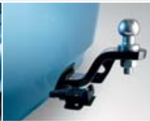
1200KG TOWBAR, TOWBALL & TRAILER WIRING HARNESS (SOLD SEPARATELY) Applicable for all Camry grades.