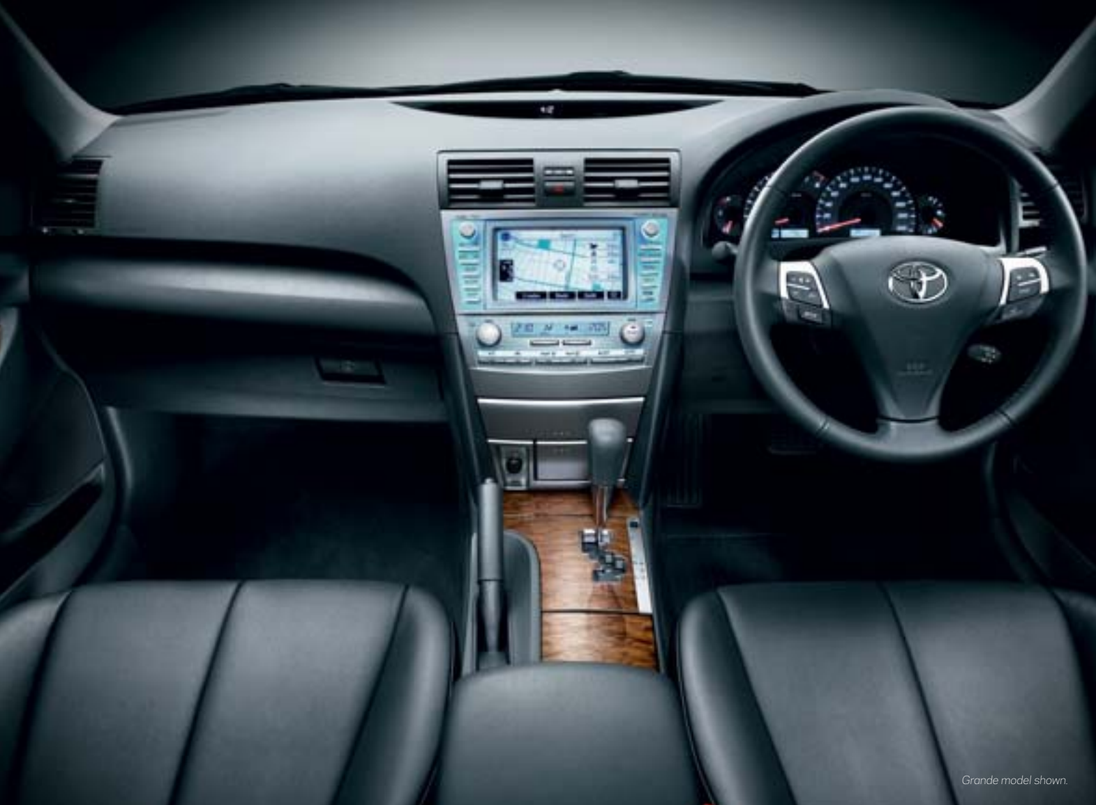
Grande model shown.