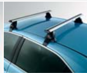
ROOF RACKS (2 BAR SET) Applicable for all Camry grades.