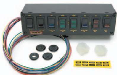
#50202 8-Switch Self Contained Box. Easy roll bar mounting.