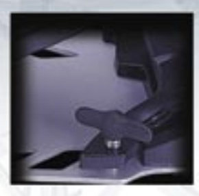
Side Tensioning Hoop Grabber

Allows for faster and easier setup and teardown, every gig