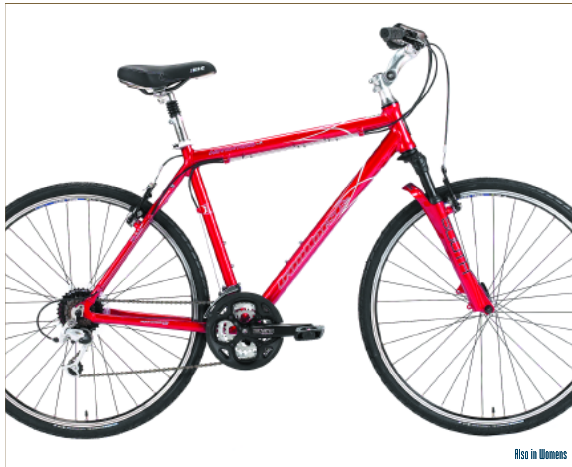
Also in Womens