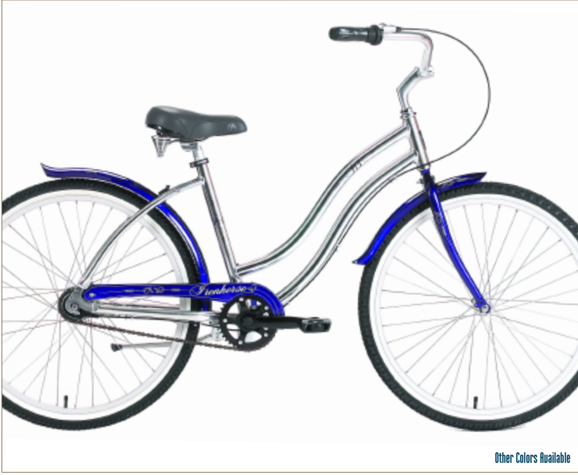
Other Colors Available