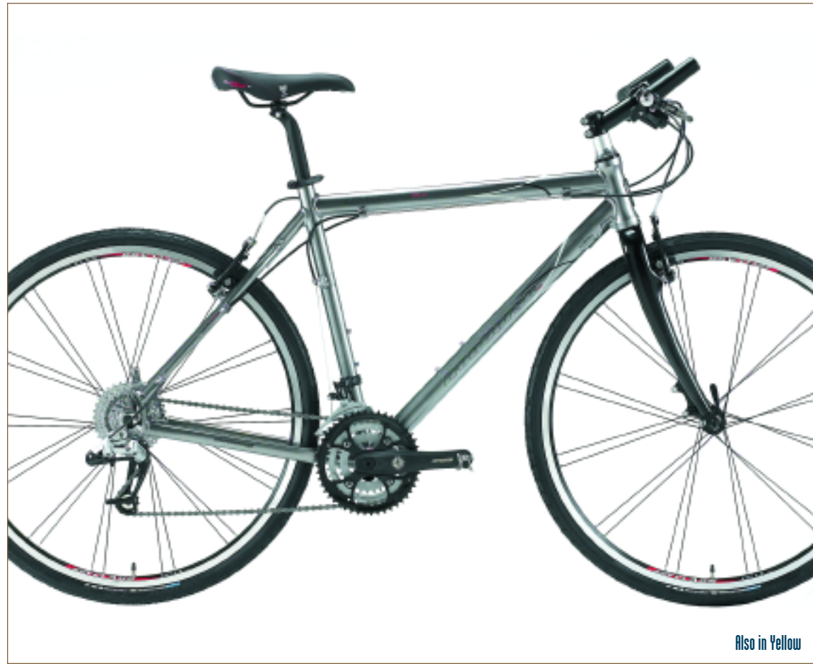
Also in Yellow