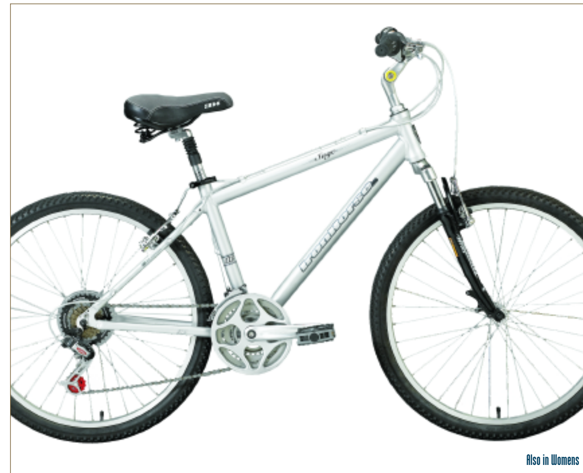
Also in Womens