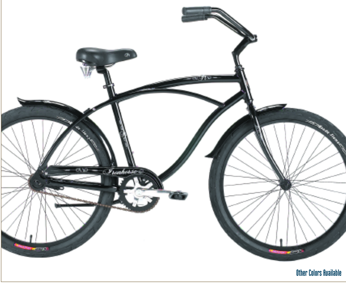
Other Colors Available