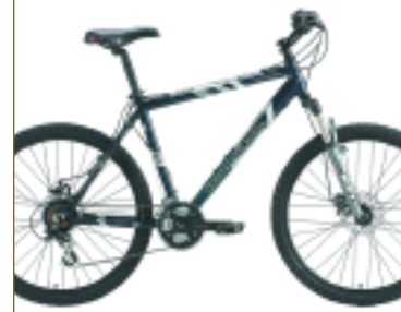
Maverick Disc - Blue