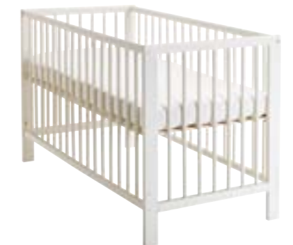
GULLIVER cot $229 Tinted, clear lacquered solid beech. W66xL123, H80cm. White.