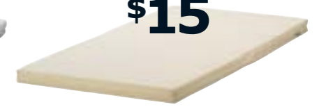
VYSSA SLAPPNA mattress $15 Polyurethane foam. W60xL120cm. 5cm thick. White.