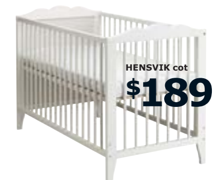
HENSVIK cot $189 Painted solid beech. Designer: Carina Bengs. W66xL123, H85cm. White.

All cots take mattress size W60xL120cm (sold separately).