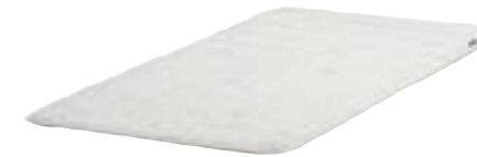
VYSSA TRÖST mattress pad $39 Machine washable - easy to keep clean. Warmth-regulating layer helps keep the temperature right. Fits all our cots. Temperature-regulating polyester. W60xL120cm. 1.5cm thick. White/blue.

A machine washable mattress pad makes it easier to keep your baby's sleeping environment nice and clean – which in turn helps to keep dust-mites and mildew at bay.