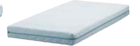
VYSSA VINKA mattress $69 Bonell springs and polyurethane foam. W60xL120cm. 10cm thick. Blue.