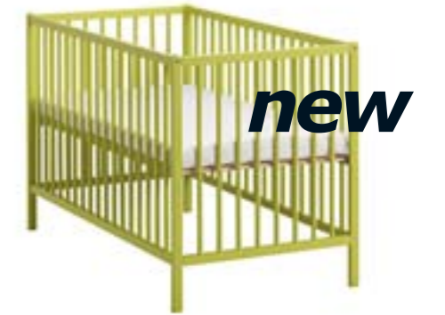
new SOMNAT cot $99 Painted solid beech. W66xL124, H80cm. Green. Also available in blue and pink.

VITAMINER RAND 4-piece bedlinen set for cot $19 Comprises: Blanket (70x90cm), quilt cover (110x125cm), pillowcase (35x55cm) and fitted sheet (60x120cm). 100% cotton. Designer: Sirpa Cowell. Multicolour.