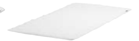
VYSSA TULTA mattress pad $19 Machine washable - easy to keep clean. Air can circulate through the pad. Polyester wadding. W60xL120cm. 1.5cm thick. White.