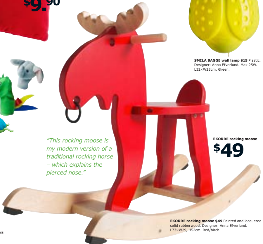
EKORRE rocking moose $49

"This rocking moose is my modern version of a traditional rocking horse – which explains the pierced nose."