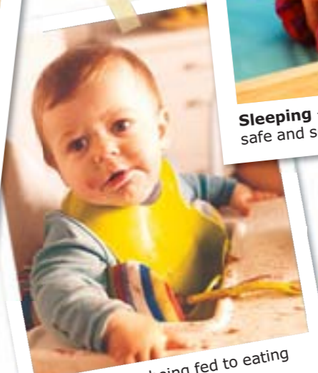
Eating – from being fed to eating by themselves.