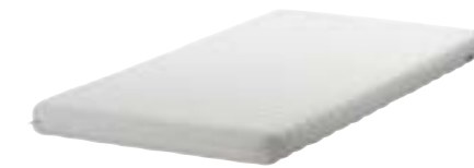
VYSSA SLÖA mattress $49 Polyurethane foam. W60xL120cm. 8cm thick. White.