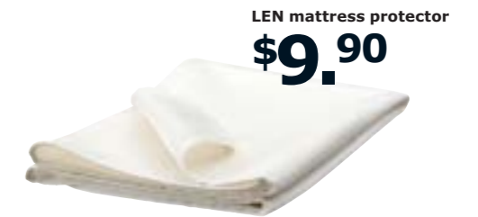
LEN mattress protector $9.90 Waterproof backing provides protection for the mattress. 100% cotton. Backing: synthetic rubber. W70xL100cm. White.

A mattress protector is good for those little accidents that are such a natural part of baby life. Since the material is non-breathable, it's important not to place the protector underneath your baby's head.