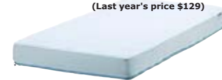
VYSSA VACKERT mattress $99 (Last year's price $129) Pocket springs and polyurethane foam. W60xL120cm. 10cm thick. Blue.

VYSSA VACKERT mattress $99 (Last year's price $129)