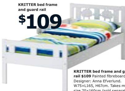
KRITTER bed frame and guard rail $109