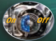
CHASING L.E.D. TIMING COVER (SEVEN COLOR L.E.D. TECHNOLOGY)

REFER TO PRODUCT LISTINGS IN CATALOG FOR SPECIFIC FITMENT INFORMATION