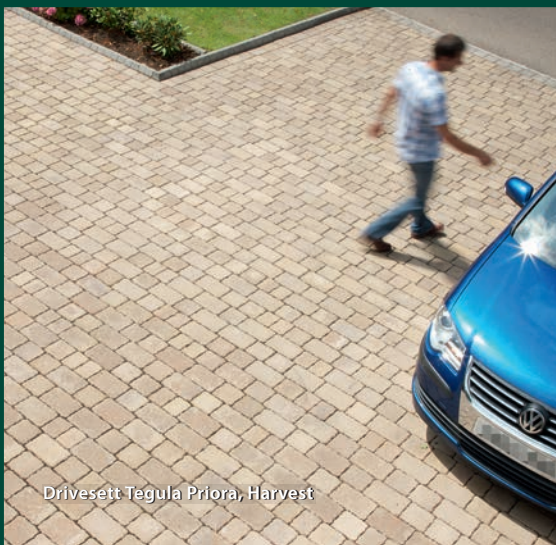
Drivesett Tegula Priora, Harvest