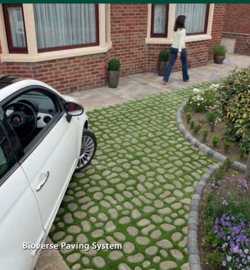
Bioerse Paving System