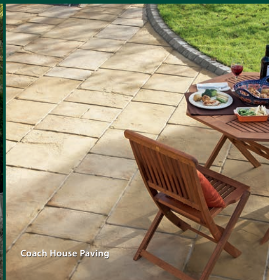
Coach House Paving