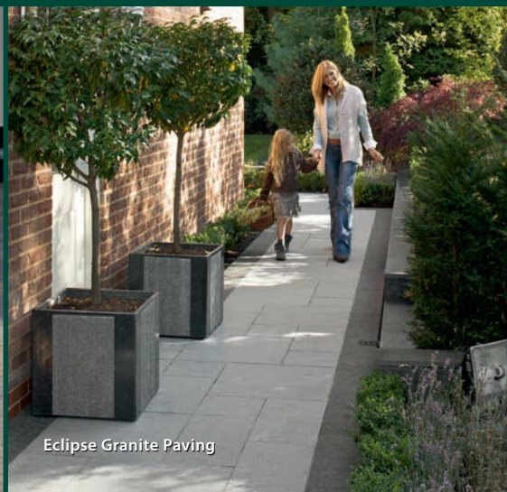
Eclipse Granite Paving