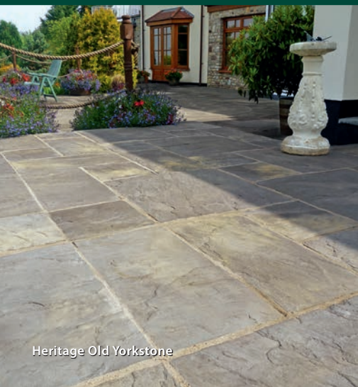
Heritage Old Yorkstone