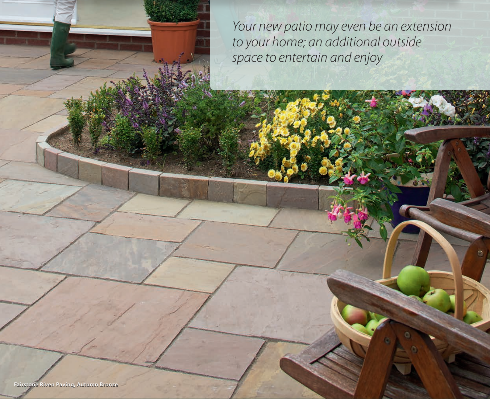
Fairstone Riven Paving, Autumn Bronze

Your new patio may even be an extension to your home; an additional outside space to entertain and enjoy