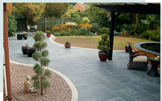
TS Benson Paving Services, Lincoln