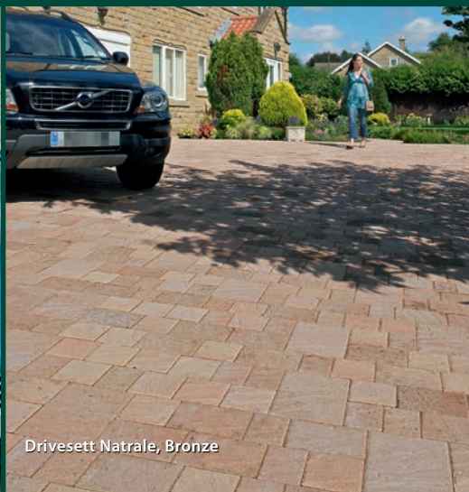
Drivesett Natrale, Bronze