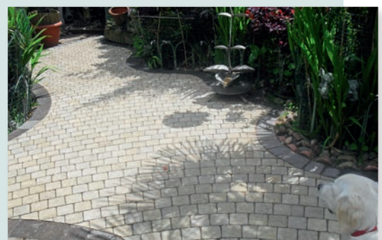
SPG Construction, Sutton in Ashfield