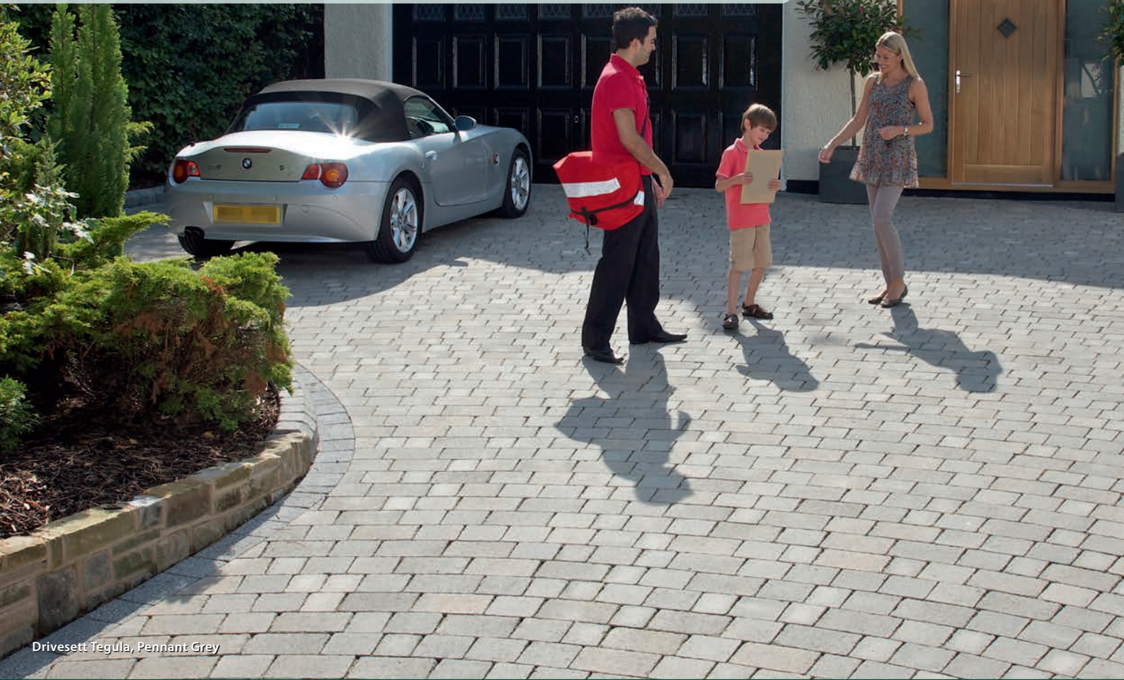
Drivesett Tegula, Pennant Grey

“Marshalls believes that we all need places that make us feel safer, happier and more sociable. Places to be ourselves, where we can live, play, create and grow...” Marshalls