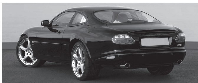
2003 "R" Coupe