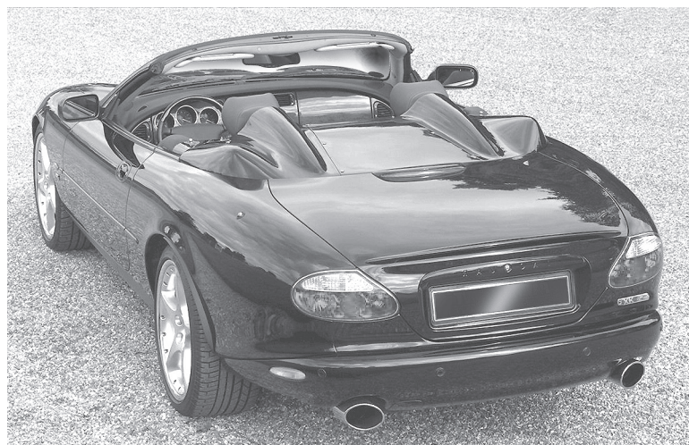
2005 XK8 With Hard Shell Tonneau