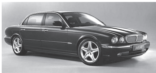
2005 "R" Series