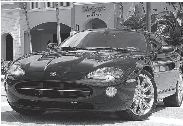
2005 XK8 Coupe