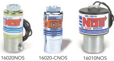
16020NOS 16020-CNOS 16010NOS

The Leader In Nitrous. For 27 years NOS has been pioneering the nitrous industry with the most dominant nitrous products, sales, service, tech support, and customer satisfaction. Drag racing is at the backbone of NOS, in fact almost every major nitrous milestone in racing has come from an NOS system. Put the nitrous leader to work for you-NOS!