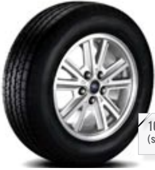
16" Painted Aluminum Wheels (standard on V6 Deluxe)