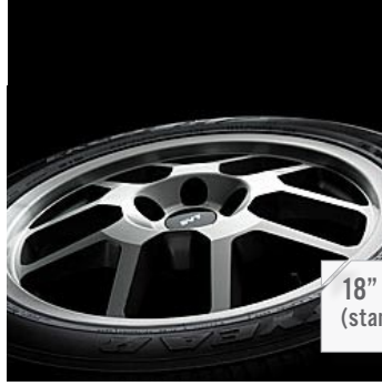
18" Machined Aluminum Wheels (standard on Shelby GT500)