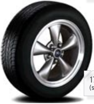
17" Painted Aluminum Wheels (standard on GT Deluxe and Premium)