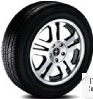
17" Aluminum Wheels (optional on V6 Premium, GT Deluxe, and GT Premium)