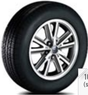
16" Painted Aluminum Wheels (standard on V6 Premium; optional on V6 Deluxe)