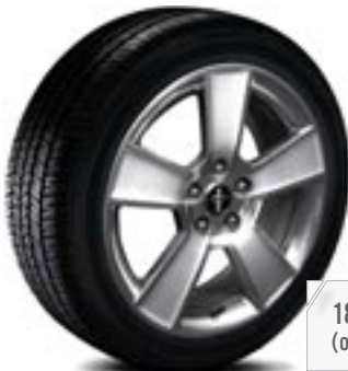
18" Polished Aluminum Wheels (optional on GT)